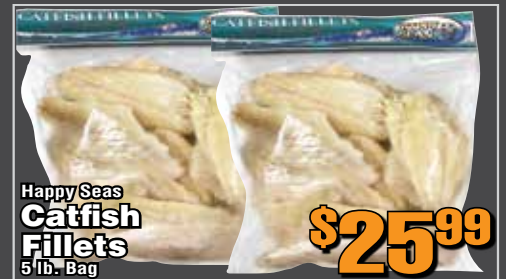
Happy Seas Catfish Fillets 5 lb. Bag