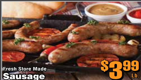
Fresh Store Made Sausage