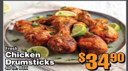
Fresh Chicken Drumsticks 40 lb. Box