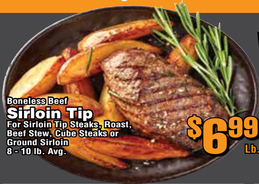
Boneless Beef Sirloin Tip For Sirloin Tip Steaks, Roast, Beef Stew, Cube Steaks or Ground Sirloin 8 - 10 lb. Avg.