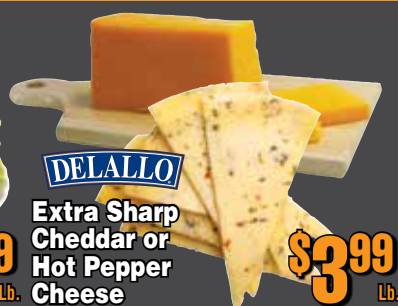
DELALLO Extra Sharp Cheddar or Hot Pepper Cheese