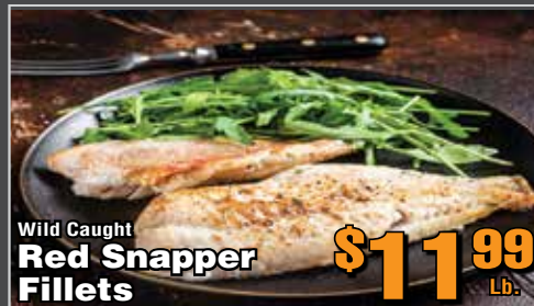
Wild Caught Red Snapper Fillets