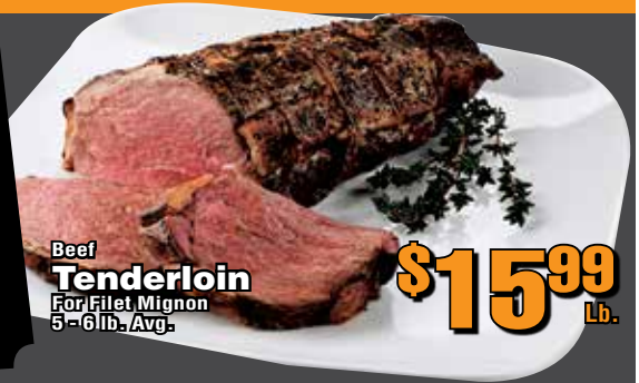
Beef Tenderloin For Filet Mignon 5 - 6 lb. Avg.

SERVED UP WITH CATTLEMAN'S MEATS! ALL OUR PACKING HOUSE CUTS ARE SLICED FREE TO ORDER!