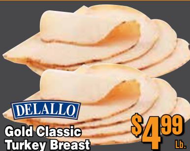
DELALLO Gold Classic Turkey Breast