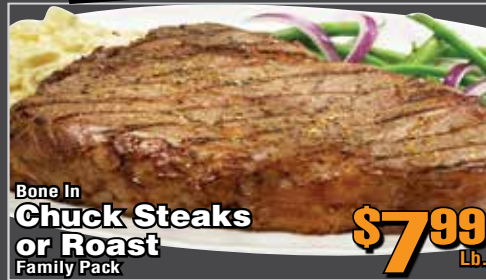
Bone In Chuck Steaks or Roast Family Pack