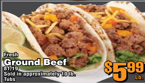
Fresh Ground Beef 8 1/2 lb. Sold in approximately 10 lb. Tubs