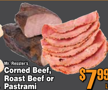
Mr. Ressler's Corned Beef, Roast Beef or Pastrami