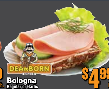
DEARBORN Bologna Regular or Garlic