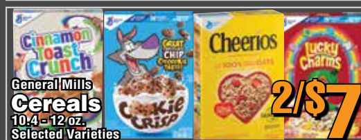
General Mills Cereals 10.4 - 12 oz. Selected Varieties 2/$7