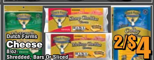
Dutch Farms Cheese 8 oz. Shredded, Bars Or Sliced 2/$4

11400 TELEGRAPH ROAD, TAYLOR, MI, 48180 734-287-8260