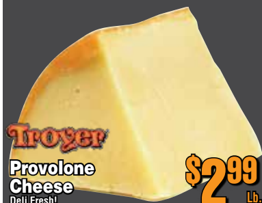
Troyer Provolone Cheese Deli Fresh!