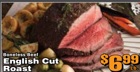
Boneless Beef English Cut Roast