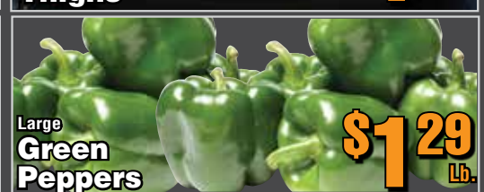
Large Green Peppers $1 29 Lb.