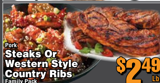
Pork Steaks Or Western Style Country Ribs Family Pack $2 49 Lb.