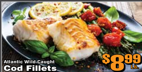
Atlantic Wild Caught Cod Fillets