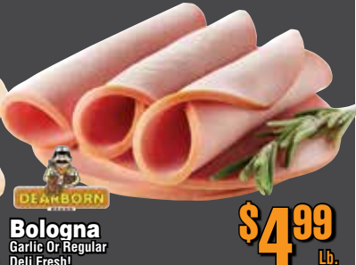
DEARBORN Bologna Garlic Or Regular Deli Fresh!