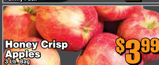
Honey Crisp Apples 3 Lb. Bag $3 99