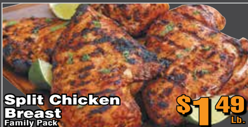
Split Chicken Breast Family Pack