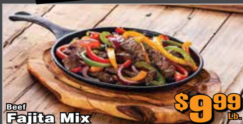
Beef Fajita Mix