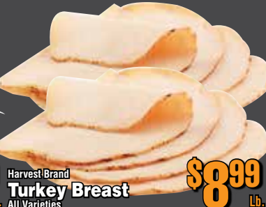
Harvest Brand Turkey Breast All Varieties