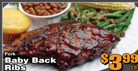
Pork Baby Back Ribs