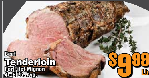
Beef Tenderloin For Filet Mignon 4-5 Lb. Avg. $9 99 Lb.