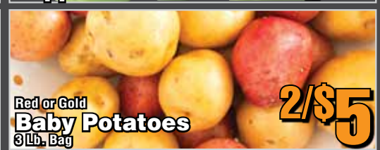
Red or Gold Baby Potatoes 2/$5 3 Lb. Bag