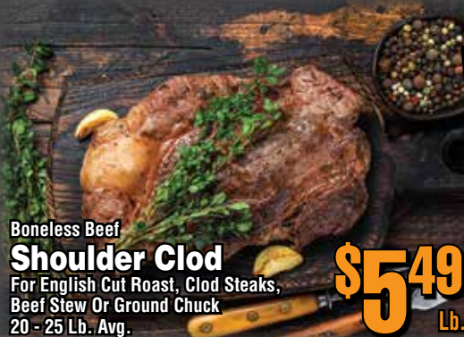
Boneless Beef Shoulder Clod

For English Cut Roast, Clod Steaks, Beef Stew Or Ground Chuck 20 - 25 Lb. Avg.