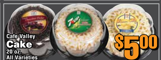
Cafe Valley Cake 20 oz. All Varieties $5 00