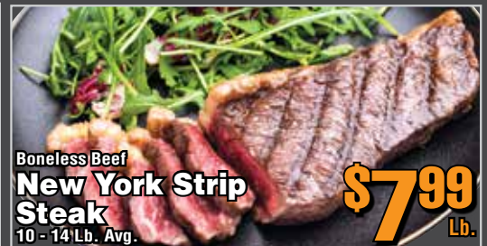
Boneless Beef New York Strip Steak 10 - 14 Lb. Avg. $7 99 Lb.