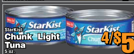
Starkist Chunk Light Tuna 5 oz. 4/$5