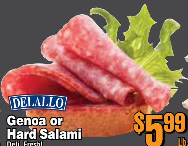
DELALLO Genoa or Hard Salami Deli Fresh!