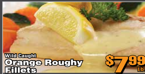
Wild Caught Orange Roughy Fillets