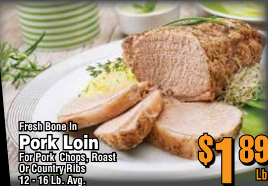
Fresh Bone In Pork Loin For Pork Chops, Roast Or Country Ribs 12 - 16 Lb. Avg.

SERVED UP WITH CATTLEMAN'S MEATS! ALL OUR PACKING HOUSE CUTS ARE SLICED FREE TO ORDER!