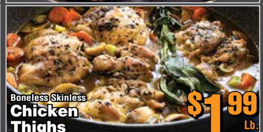
Boneless Skinless Chicken Thighs $1 99 Lb.