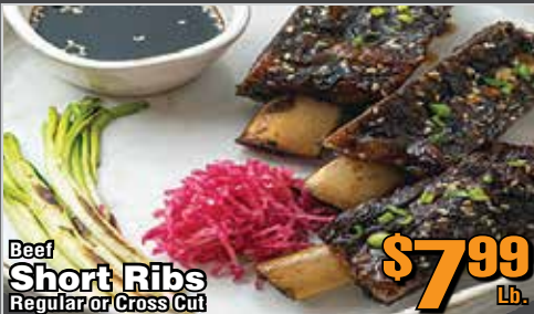
Beef Short Ribs Regular or Cross Cut