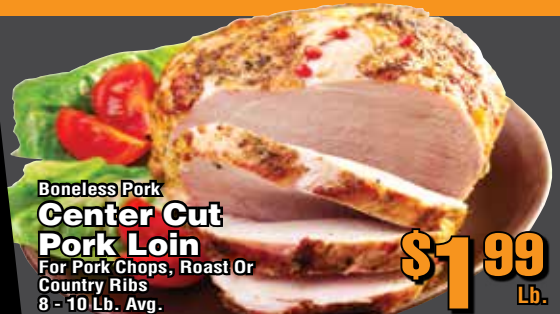
Boneless Pork Center Cut Pork Loin For Pork Chops, Roast Or Country Ribs 8 - 10 Lb. Avg.

SERVED UP WITH CATTLEMAN'S MEATS! ALL OUR PACKING HOUSE CUTS ARE SLICED FREE TO ORDER!