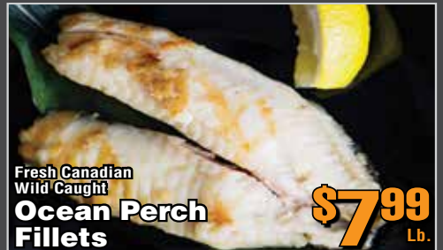
Fresh Canadian Wild Caught Ocean Perch Fillets