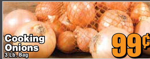
Cooking Onions 3 Lb. Bag