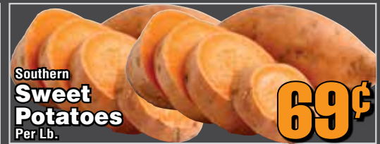
Southern Sweet Potatoes Per Lb.