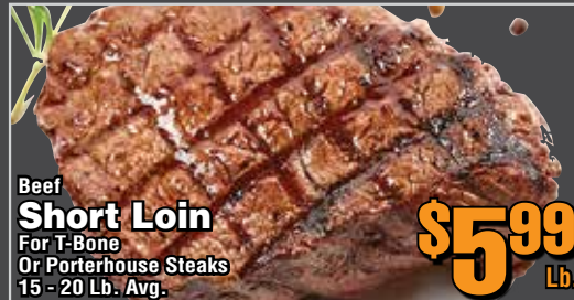
Beef Short Loin For T-Bone Or Porterhouse Steaks 15 - 20 Lb. Avg.