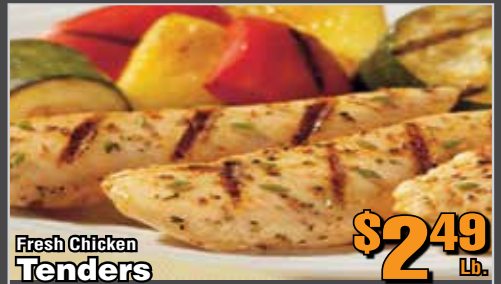
Fresh Chicken Tenders