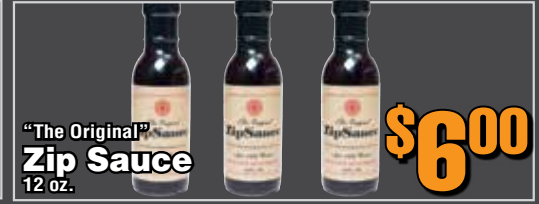
"The Original" Zip Sauce 12 oz.