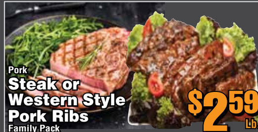
Pork Steak or Western Style Pork Ribs Family Pack