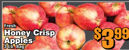
Fresh Honey Crisp Apples 3 Lb. Bag