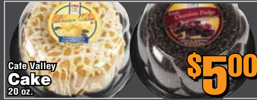
Cafe Valley Cake 20 oz.