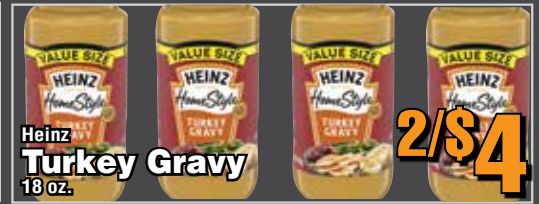
Heinz Turkey Gravy 18 oz.