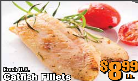
Fresh U.S. Catfish Fillets