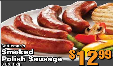
Cattleman's Smoked Polish Sausage 3 Lb. Pkg.