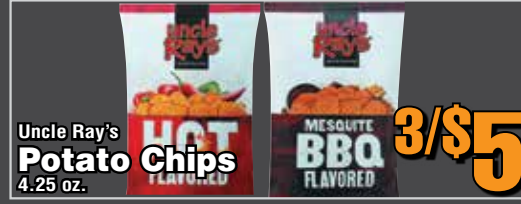
Uncle Ray's Potato Chips 4.25 oz.