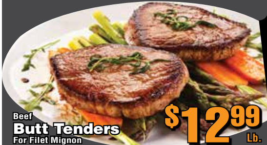
Beef Butt Tenders For Filet Mignon