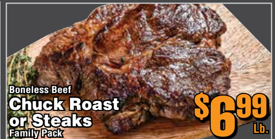
Boneless Beef Chuck Roast or Steaks Family Pack