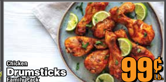
Chicken Drumsticks Family Pack