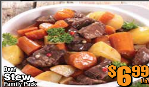
Beef Stew Family Pack