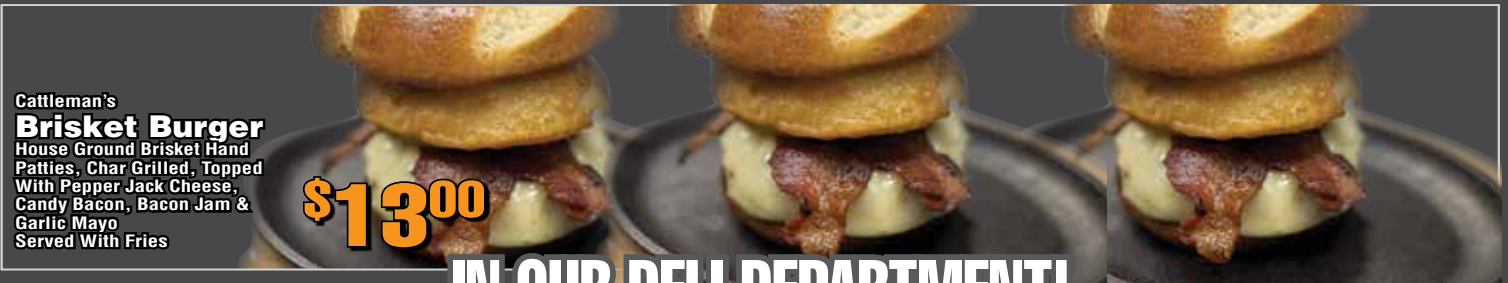
Cattleman's Brisket Burger House Ground Brisket Hand Patties, Char Grilled, Topped With Pepper Jack Cheese, Candy Bacon, Bacon Jam & Garlic Mayo Served With Fries